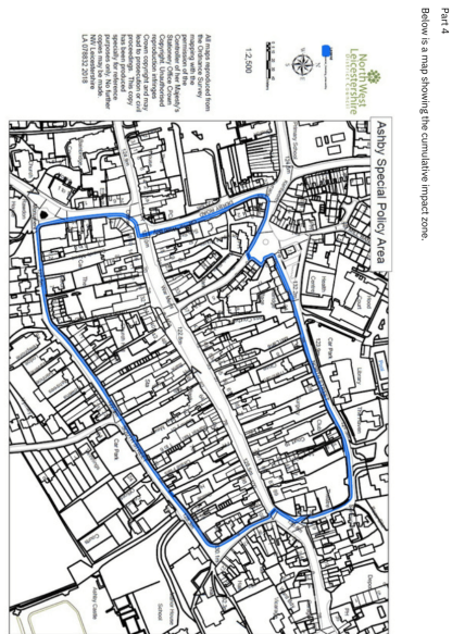
Part 4 Below is a map showing the cumulative impact zone.

Objectives that will be met to prevent crime and disorder in the locality of the area in which the licensee has applied.